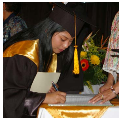
“My sponsor encouraged me to keep striving every day”