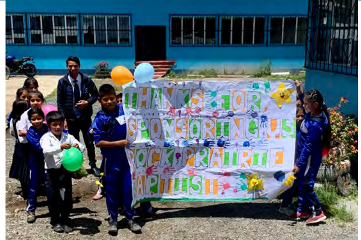
A huge banner welcomes the Rock Prairie team as they meet their sponsor class