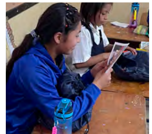
Homemade postcards foster connection between kids at home and kids in Guatemala