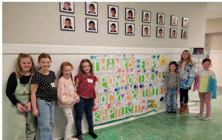
Through sponsorship, Rock Prairie kids are growing in awareness of God’s heart for the world